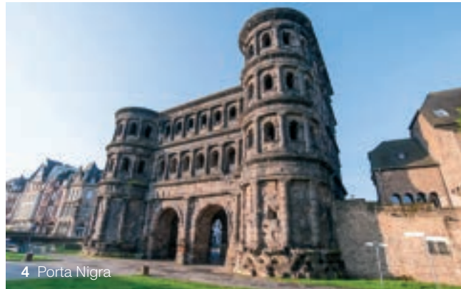
4 Porta Nigra

Trier fascinates everyone interested in antiquity – after all, nowhere other than here is it possible to get closer to the splendour of the Roman Empire throughout Central Europe. At the time of Marcus Aurelius, Augusta Treverorum, the oldest city in Germany, experienced its first great period of prosperity. The city's fortifications were also built at this time and with them the "Porta Nigra", the ancient city gate, which remains Trier's landmark to this day. The city impresses with its monumental Roman buildings, which are part of the UNESCO World Heritage bringing the antiquity to life.