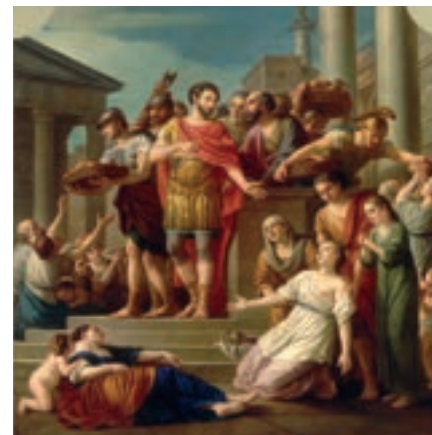
3 Painting by Joseph Marie Vien, Marc Aurèle secourant le peuple, 1765

For centuries, Marcus Aurelius and his „Meditations“ have attracted interest not only from rulers, but also from political philosophers, moral philosophers and artists. Based on this reception history, the Stadtmuseum Simeonstift displays high quality exhibits to encapsulate how artistic representations of “good governance” have changed over the course of history: When is a period of rule considered good and just? The paintings, sculptures, caricatures and media from eight centuries of art history shed light on this question, as a fascinating constant of human history with considerable topicality.