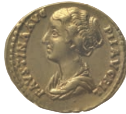
2 Gold coin with portrait of Faustina Minor (wife of Marcus Aurelius), 2nd century AD.